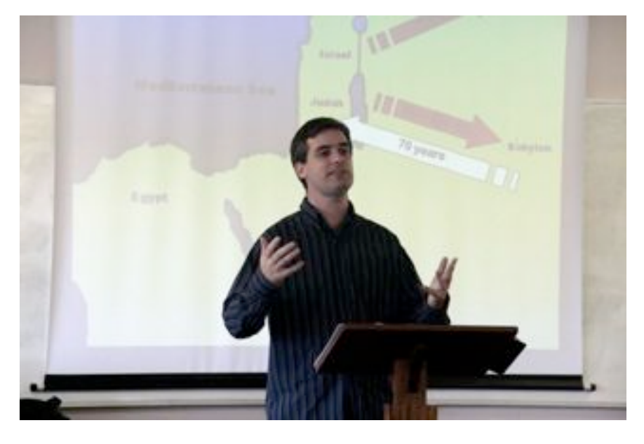
"For we do not preach ourselves, but Jesus Christ as Lord, and ourselves as your servants for Jesus' sake." 2 Corinthians 4:5

The course is designed for students who have gone through the ENTRUST Training Course , have demonstrated some level of giftedness in handling God's Word, and have a desire to preach the Gospel of Jesus Christ. Applications from Bible college/seminary students (from South Africa or overseas) will be considered after the pool of ENTRUST Training Course applicants.