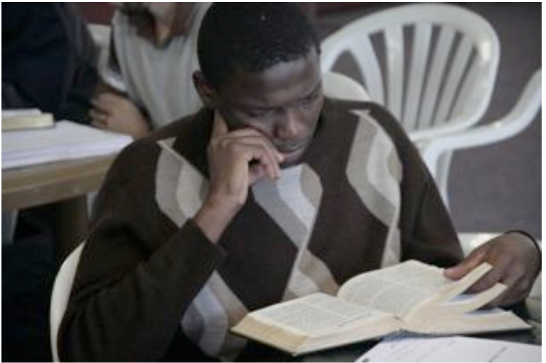
"Raising up and training a new generation of Gospel workers..."

" Put it across "— equip students to become better communicators of God's Word.