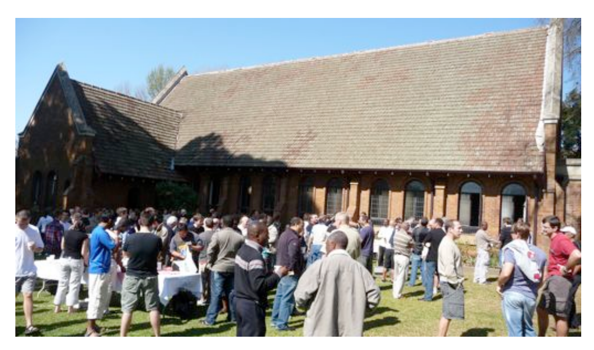
"What you have heard from me in the presence of many witnesses entrust to faithful men who will be able to teach others also." 2 Timothy 2:2

The ENTRUST Women's Convention takes place each August and encourages and challenges women to, by God's grace, live under the Lordship of Jesus Christ.